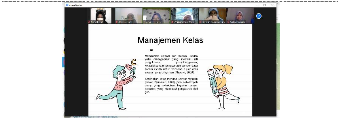
Figure 1. When Students Make Presentations Online, the Learning Process

Students in Figure 1 are giving a presentation on class management. The students appear to be completely concentrated on giving their speeches. Students who did not deliver a presentation listened to their friend's explanation during the presentation and did not raise a fuss by turning off the speaker button until their friend concluded. Students who were not present turned on the camera as a show of support for their friends who were explaining the outcomes of their group's effort. The students' seating position demonstrates their regard for their classmates.