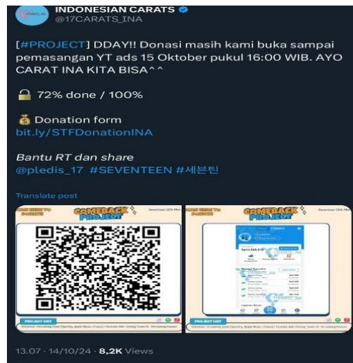
Figure 4. Donations Conducted by Carat Indonesia

centers on evaluating the effectiveness of their collective voting efforts and assessing the sub-unit's chances of securing a win on the *M-Countdown* music program. This interaction reflects a more strategic and goal-oriented form of engagement, demonstrating how online fandom communities mobilize their resources and coordinate actions in pursuit of shared objectives. It also highlights the role of private digital spaces such as GDMS in fostering collective decision-making, reinforcing solidarity, and amplifying the sense of agency among members as they work together to support their idols. Beyond streaming and voting, Carat community members also demonstrate their support through financial contributions such as purchasing albums and making donations. These donations are typically allocated to acquire additional accounts or other necessary resources to maximize voting and streaming.