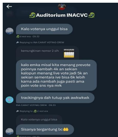
Figure 3. Discussion Within the Group Direct Message

Referring to the statements of the two informants, the researcher identified collective activities within the community, specifically streaming and voting. These two actions are considered the most fundamental ways for Indonesian fans to support their idols, given Indonesia's geographical distance from South Korea, where Seventeen is based. Moreover, Carat Indonesia has been recognized as one of the most active fanbases in streaming and voting, compared to Carat communities worldwide. During the comeback period, the members' participation increased significantly. Observations revealed that fans actively encourage each other to participate in streaming and voting, often sharing strategies and guidelines for execution. Discussions on voting strategies frequently occur in Group Direct Messages (GDM), where conversations tend to be more detailed. Fans seeking comprehensive information and tutorials on streaming and voting typically join dedicated groups focusing on these activities. Additionally, members work collectively to maximize voting efforts to help Seventeen secure awards.