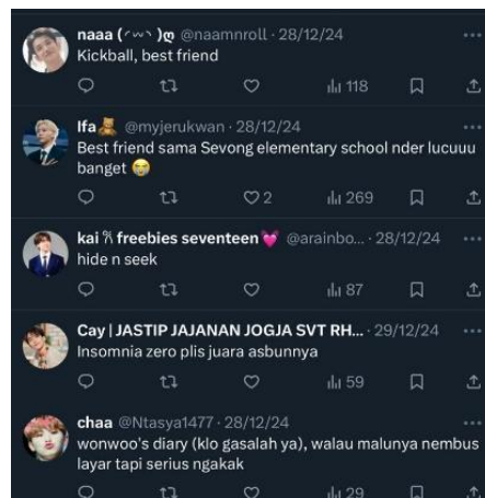
Figure 2. Carat Community Discussion in the Comment Section

In the highlighted post, the user asks for opinions on the most exciting episodes of the Seventeen variety show, Going Seventeen (commonly abbreviated as "GoSe"). The post received 27 replies, 37 reposts and quote reposts, 319 likes, 56 bookmarks, and 7,100 views in response.