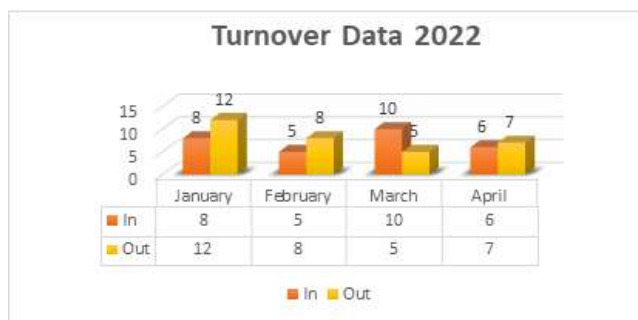
Figure 1. Turnover Data 2022

The company K-55 Guards Security Service is located at Jalan Alternative Transyogi KM 3 Cibubur, Pondok Gede Bekasi, Cileungsi, West Java, Indonesia 17435. The company was established in 2008 with the legality of official establishment recognized by the Indonesian National Police and other Government Agencies related to establishment of a Security Service Business Entity (BUJP). The K-55 Guards Security company is a professional and experienced security service provider (Outsourcing) in the field of security and security consultants with experienced Human Resources (HR) personnel in their fields. Having a vision To be a reliable, quality and dedicated business partner while still placing equal obligations and rights in realizing good cooperation in order to achieve success through honesty, sincerity and togetherness. And has a mission to become a professional security service provider company that integrates with business partners. To guide the nation in elevating the image of security personnel by building a strong mental attitude, character, excellence, quality and professionalism in the security sector. Creating and building a harmonious security climate in all work areas and maintaining good relations with business partners and the government through outsourcing systems.