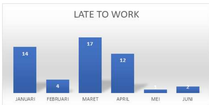
Figure 1. Timeliness Data Source; PT. SAI (2021)

Based on Figure 1, it can be seen that the problems that occur in morale affect employees, seen from the data on delays in the warehouse employees of PT. S AI, totaling 44 people, employees who were late for work in 2021 in January 14 times a month, in February 4 times, in March 17 times, in April 12 employees were late, in May 1 time and in June 2 times. The level of delay is something that needs to be paid attention to, because it is related that work morale affects performance. From these data, it shows that the problem of the level of morale is still low that occurs at PT S AI so that it makes employees lazy to come to the company and results in work not as expected. Morale must be increased at work, because if morale is not increased it will result in a high number of absenteeism in employees which affects the decline in targets set by the company, because work discipline is one of the keys to achieving the company's success in realizing its goals. Work discipline will encourage employee performance within the company, because the company continues to develop and progress, there must be employees who have high discipline. Therefore, work discipline and employee performance are two things that are always related and related. Based on the attendance data at PT. S AI still has employees who are often absent from work.