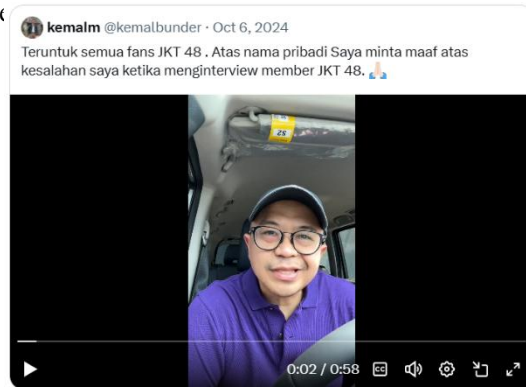
Figure 3. Broadcaster 's Apology GenFM

In the crisis management process, the first level comes from the program team that conducts internal evaluation and monitoring. They then consult with the Corporate Communication (CorCom) party to determine the level of communication that must be taken. Fortunately, the case This No lasts a long time because the broadcaster concerned is willing to provide clarification and requests Sorry in an open way. With a rapid response, the crisis was successfully dampened at the CorCom level and did not need to go up to the level of b