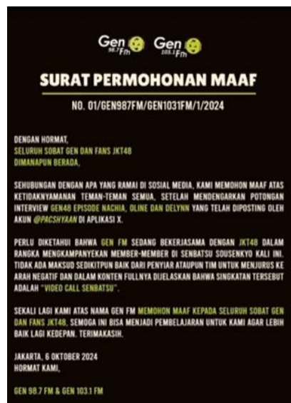
Figure 2. GenFM Releases Apology