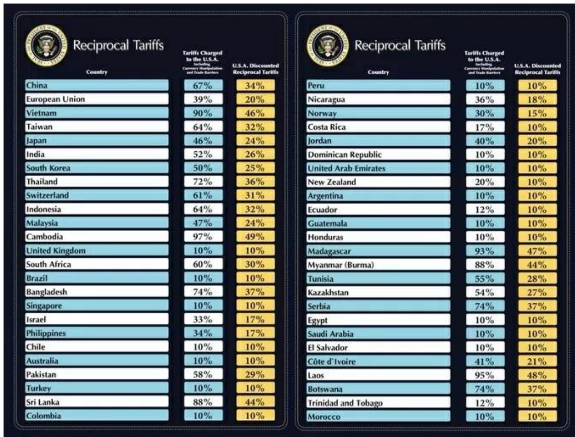
Figure 1. Reciprocal Tariff Rates Imposed by the United States on Various Countries

As shown in Figure 1, the global economy currently follows a liberal economic system marked by a trend toward free trade. The concept of a liberal economy was introduced by the United States after its victory in the Cold War, which produced a new world order in which the economy was expected to replace geopolitics as the primary force driving international relations. However, Trump adopted protectionist policies in international trade to protect the domestic market (Isnaini et al., 2024). The protectionist policy introduced by Trump runs counter to the international context in which multilateral cooperation and free trade are widely promoted to advance the global economy. In the dictionary of economic terms, protectionism refers to a policy deliberately implemented by the government to regulate imports and exports by imposing trade barriers, such as tariffs and quotas. The policy is intended to protect domestic industries or business actors from being outcompeted by foreign products or industries (Rahmawati, 2025).