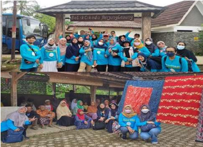
Figure 4. PKM Team and Training Participants