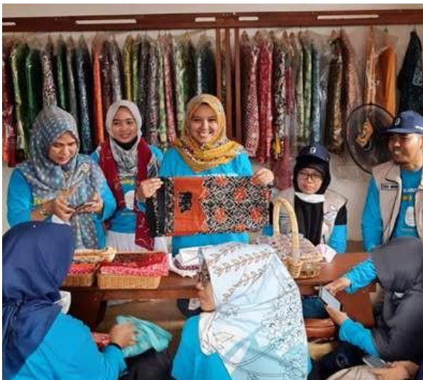
Figure 1. Implementation of Training Activities

The implementation of this community service activity is aimed at Batik SMEs in the Cikadu Batik center, Tanjung Lesung, Pandeglang district, Banten. Participants receive training and assistance related to digital marketing and e-commerce, e-commerce activities in SMEs, digital marketplaces, SME marketing strategies, and digital strategies for e-commerce. Preparatory activities begin with site surveys, licensing and coordination. Training activities for SME partners are carried out by providing material according to the topics discussed, continued with application practices on social media.