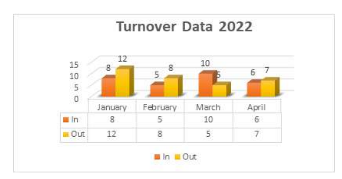
Figure 1. Turnover Data 2022 Source: K-55 Guards Security Service Company Data

The company K-55 Guards Security Service is located at Jalan Alternative Transyogi KM 3 Cibubur, Pondok Gede Bekasi, Cileungsi, West Java, Indonesia 17435. The company was established in 2008 with the legality of official establishment recognized by the Indonesian National Police and other Government Agencies related to establishment of a Security Service Business Entity (BUJP). The K-55 Guards Security company is a professional and experienced security service provider (Outsourcing) in the field of security and security consultants with experienced Human Resources (HR) personnel in their fields. Having a vision To be a reliable, quality and dedicated business partner while still placing equal obligations and rights in realizing good cooperation in order to achieve success through honesty, sincerity and togetherness. And has a mission to become a professional security service provider company that integrates with business partners. To guide the nation in elevating the image of security personnel by building a strong mental attitude, character, excellence, quality and professionalism in the security sector. Creating and building a harmonious security climate in all work areas and maintaining good relations with business partners and the government through outsourcing systems.